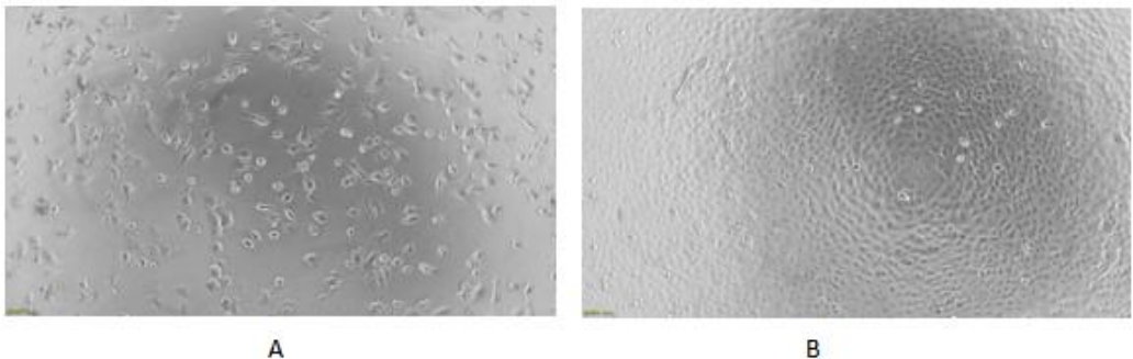
Figure 1. Inhibition of A549 cells proliferation after stimulated with FBLN2

After incubated for 72h, cells were observed by inverted microscope and cell proliferation was measured by Cell Counting Kit-8 (CCK-8). Briefly, 10 \mu l of CCK-8 solution was added to each well of the plate, then the absorbance at 450 nm was measured using a microplate reader after incubating the plate for 1h at 37 ^{\circ} C . Proliferation of A549 cells after incubation with FBLN2 for 72h observed by inverted microscope was shown in Figure 1. Cell viability was assessed by CCK-8 (Cell Counting Kit-8 ) assay after incubation with recombinant mouse FBLN2 for 72h. The result was shown in Figure 2. It was obvious that FBLN2 significantly inhibit cell viability of A549 cells. The ED50 is 1.25 \mu g/mL.