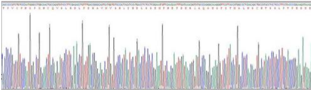
Figure 2. Gene Sequencing (extract)