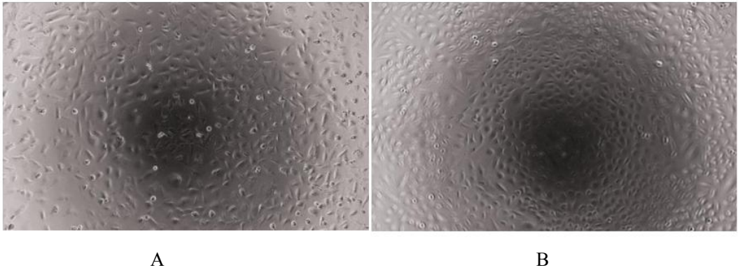
Figure 1. Inhibition of A549 cells proliferation after stimulated with TNF \alpha

viability of A549 cells. The ED50 is 4.3 \mu g/mL.