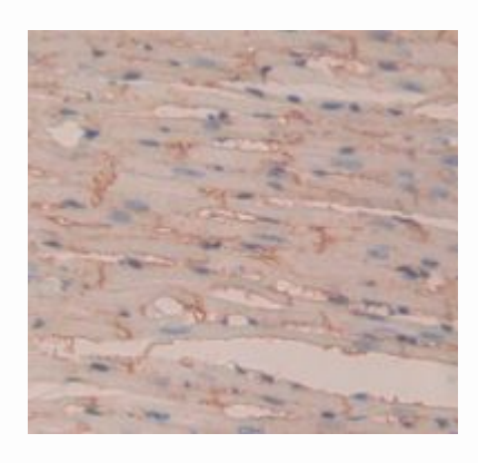
Used in DAB staining on fromalin fixed paraffin- embedded heart tissue