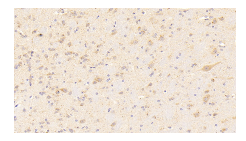
DAB staining on IHC-P; Samples: Rat Cerebrum Tissue; Primary Ab: 10?g/ml Rabbit Anti-Rat NOX3 Antibody Second Ab: 2µg/mL HRP-Linked Caprine Anti-Rabbit IgG Polyclonal Antibody (Catalog: SAA544Rb19)