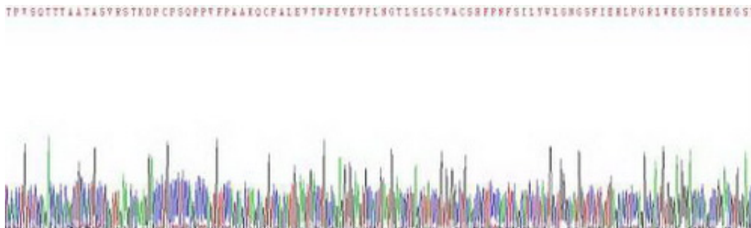
Figure . Gene Sequencing (extract)